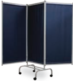
Model 3170-17 shown

Unlike similar style aluminum models the Privess™ Basic 3-Panel Privacy screen offers portable, high-quality steel framed privacy protection in a value priced package. Imported (Taiwan).