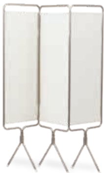
Model 3730 shown

Privess™ Elite showcases significantly upgraded durability and flexibility unlike imported lightweight models with a thin sheet of vinyl. The perfect solution for healthcare institutions, surgery centers, physician offices, and clinics where stylish substantial privacy screens are desired. Made in USA.