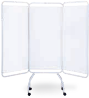
Model 3130 shown