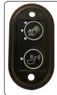
Heat and Massage (HM)

WARRANTY Contact Winco or visit our website for warranty details.