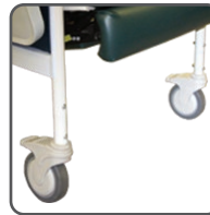
Leg Extensions (RE)