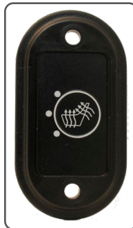
Heat Only (H)