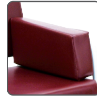
Side Cushions (SC)