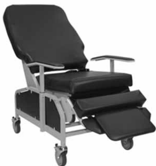
Specialty Chair Transfer Chairs