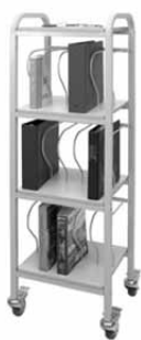
Ring Binder Carts