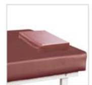
Matching Pillow MPOO