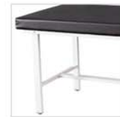
*Special Height Legs