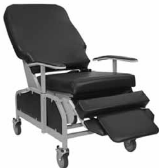
Specialty Chair Transfer Chairs