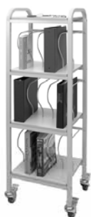
Ring Binder Carts