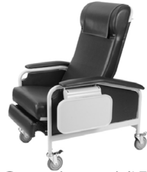
Convalescent (LTC) Recliners