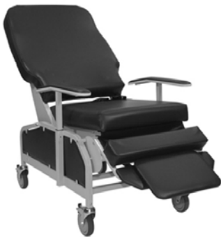
Specialty Chair Transfer Chairs