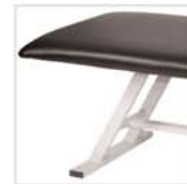
*Special Height Legs