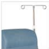
IV Pole IV (Left rear only)