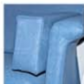
Side Cushion SC00