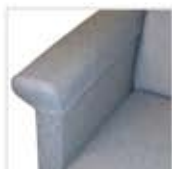
Armrest Covers AC00