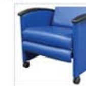
Designer Black Wheels (Note: Lowers Overall, Arm and Seat Heights by 1" from 5570) Model 5575