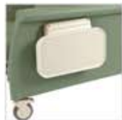
Left Side Tray LT (additional)