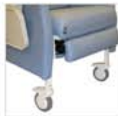
Leg Extensions SE00