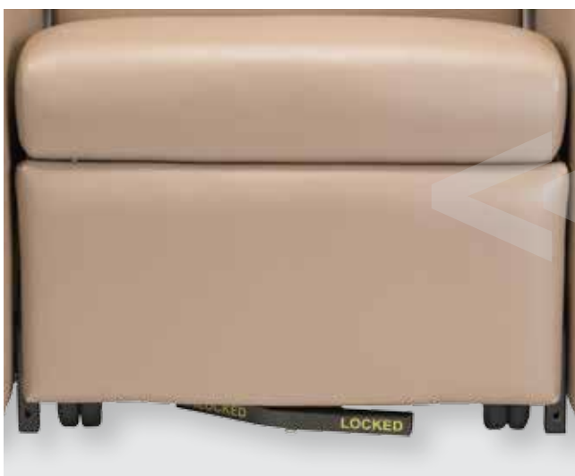
The Central Front Braking option (CFB).

Augustine is designed to mimic furniture that you would be proud to have in your own home.