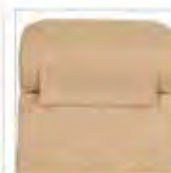
Headrest Cover HX00