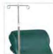
IV Pole IV