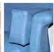
Side Cushion SC00