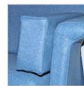
Side Cushion SC00