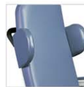
Lateral Support LS00