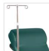
IV Pole IV