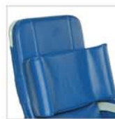
Torso Support TS00