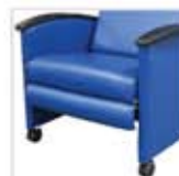
Designer Black Wheels (Note: Lowers Arm, Seat and Overall Heights by .75" from 6700) Model 6705