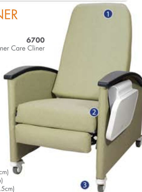
6700 Designer Care Cliner