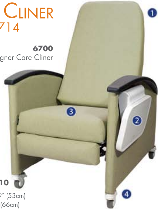
6700 Designer Care Cliner