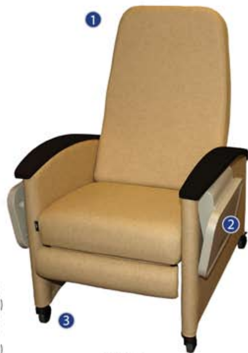
5580-RT Cozy Comfort Premier Recliner (Shown w/ optional side-tables)