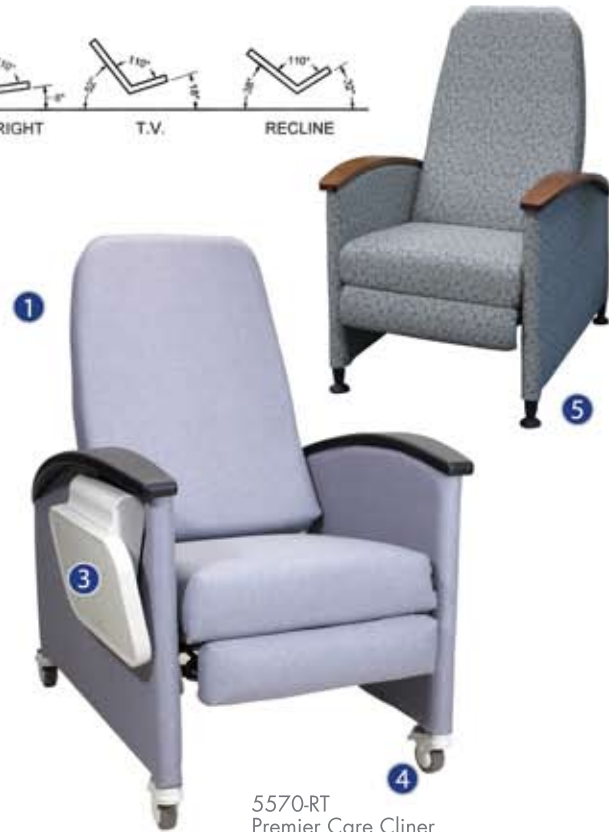
5570-RT Premier Care Cliner (Shown with optional right side-table)