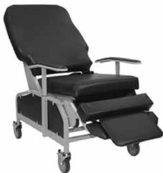
Specialty Chair Transfer Chairs