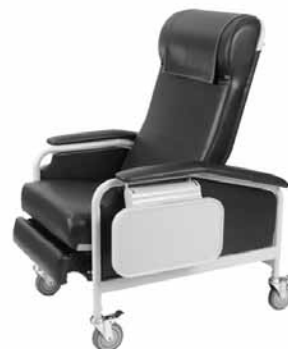
Convalescent (LTC) Recliners