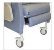
Leg Extension SE00