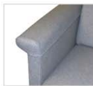
Armrest Covers AC00