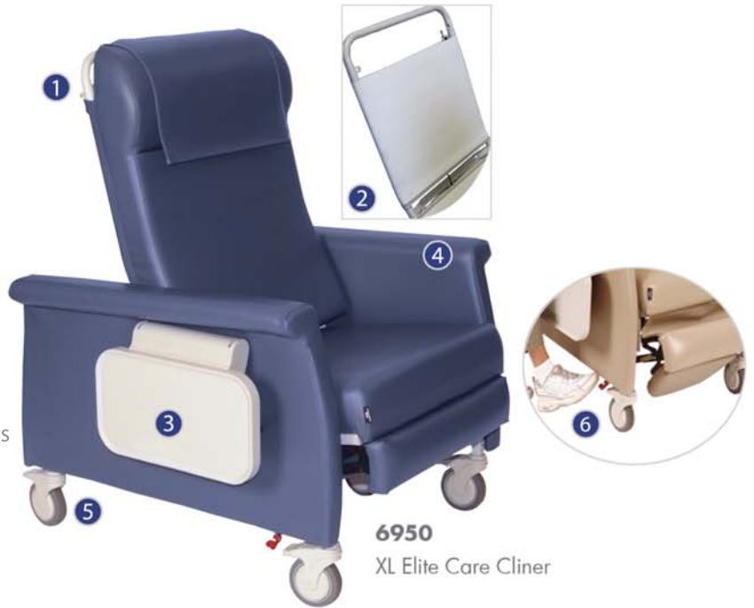
6950 XL Elite Care Cliner