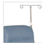
IV Pole IV (Left rear only)