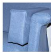
Side Cushion SC00