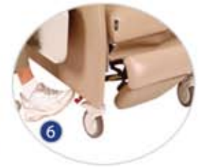
6950 XL Elite Care Cliner