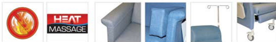
TB-133 TB Heat HT Heat & Massage HM Armrest Covers AC00 Side Cushion SC00 IV Pole IV (Left rear only) Leg Extension SE00