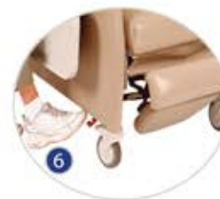
6950 XL Elite Care Cliner