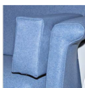
Side Cushion SC00