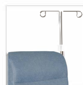
IV Pole IV