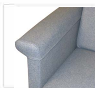
Armrest Covers AC00