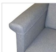
Armrest Covers AC00