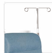
IV Pole IV