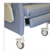
Leg Extension SE00

COLORS Available in 40+ vinyl colors. Visit our website or contact us to request swatches.