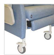
Leg Extensions SE00

COLORS Available in 40+ vinyl colors. Visit our website or contact us to request swatches.