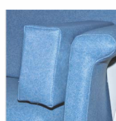
Side Cushion SC00