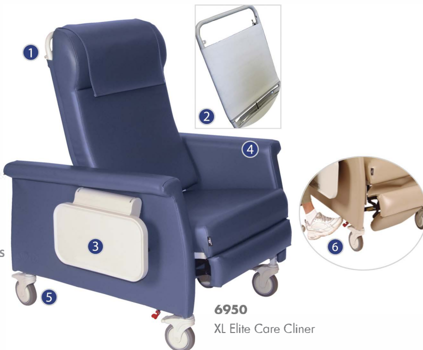
6950 XL Elite Care Cliner