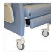
Leg Extensions SE00