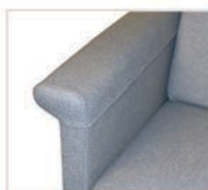
Armrest Covers AC00