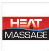
Heat HT Heat & Massage HM