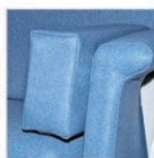
Side Cushion SC00