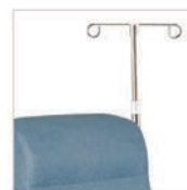
IV Pole IV (Left rear only)