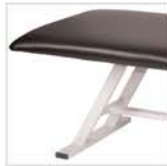
*Special Height Legs