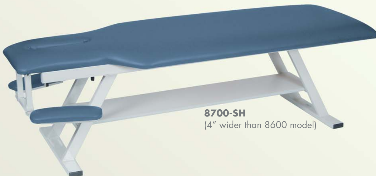
8700-SH (4" wider than 8600 model)