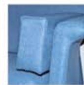
Side Cushion SC00