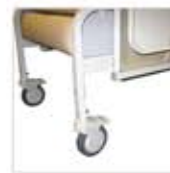
Leg Extensions SE00