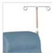
IV Pole IV (Left rear only)