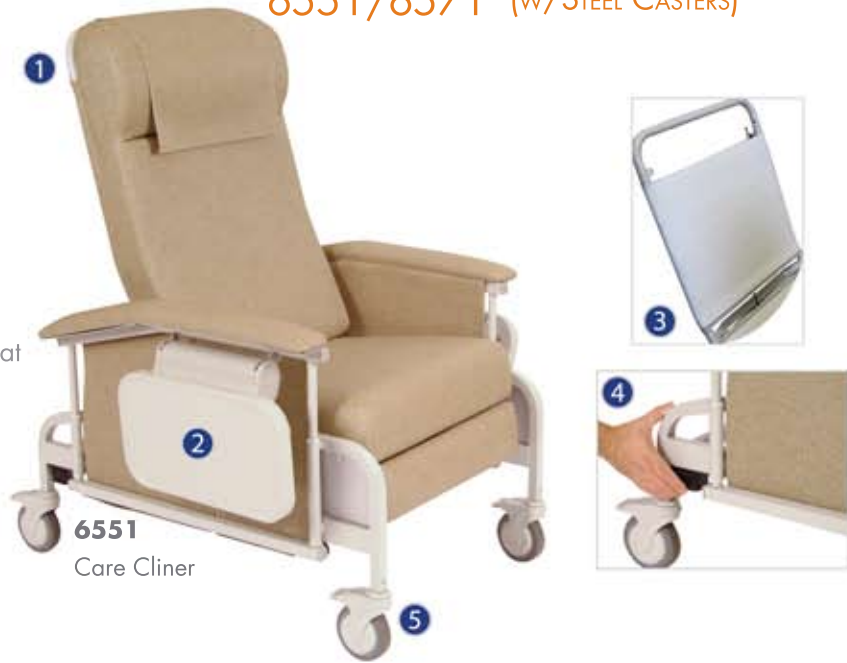
6551 Care Cliner