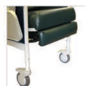
Leg Extensions RE00