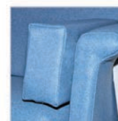
Side Cushion SC00