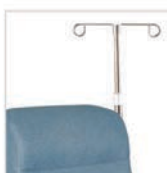
IV Pole IV (Left rear only)