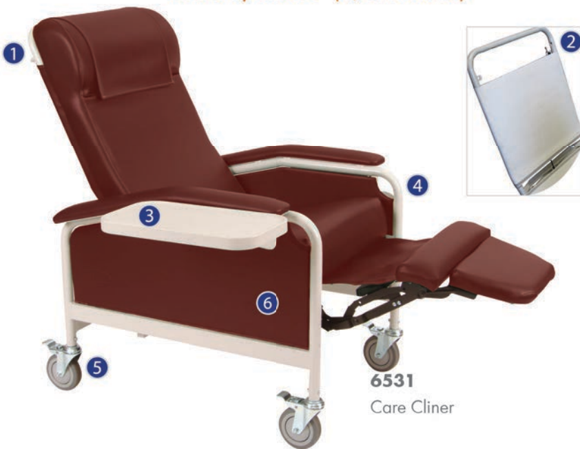
6531 Care Cliner